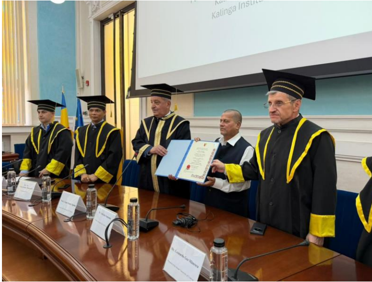
Founder of KIIT & KISS being honored by the Rector.