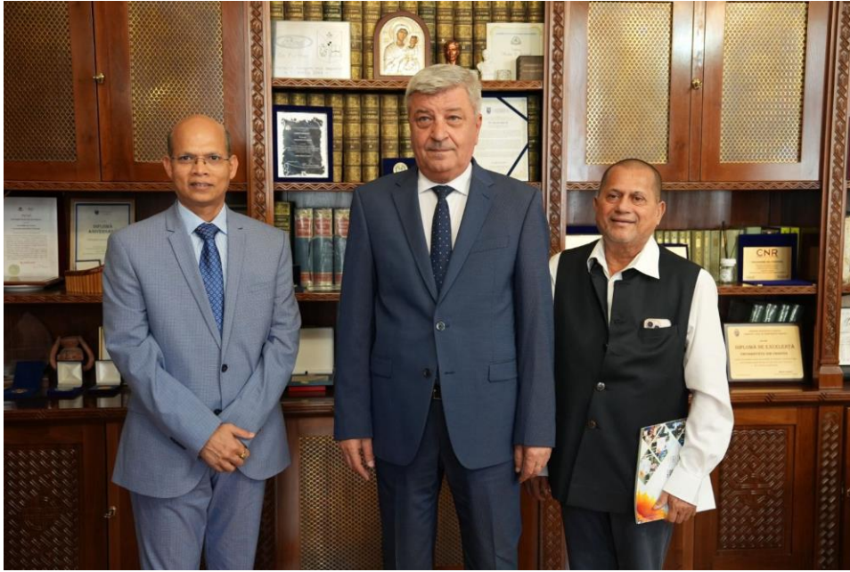
Ambassador and Founder of KIIT & KISS meeting with the Rector of the University of Craiova.