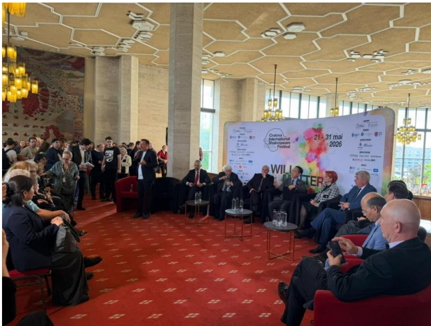
Ambassador addressed participants at the Shakespeare Festival in Craiova.