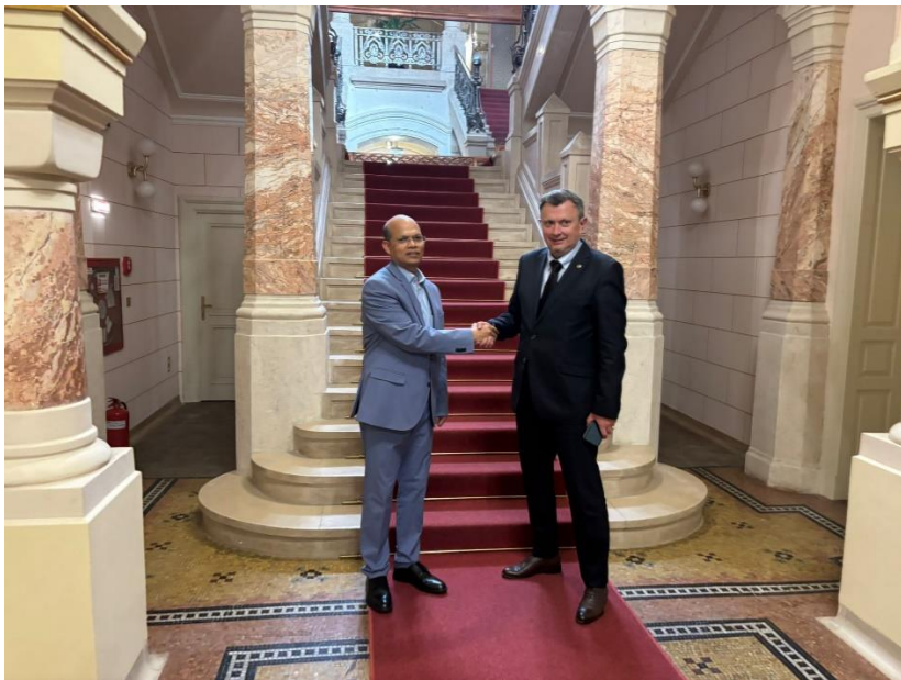
Ambassador met with Prefect of Dolj, Călinoiu Eugen-Costel.